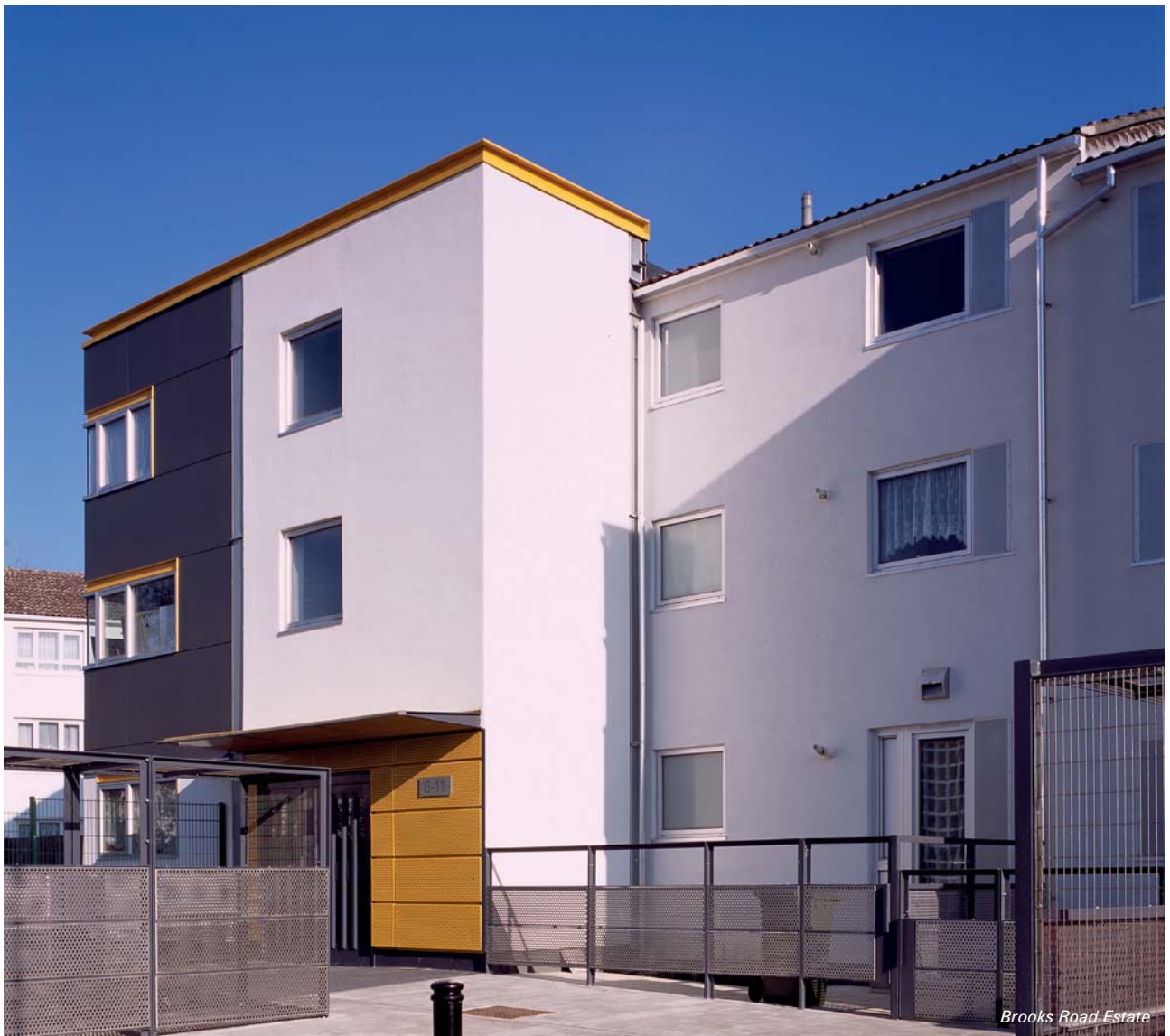
Brooks Road Estate